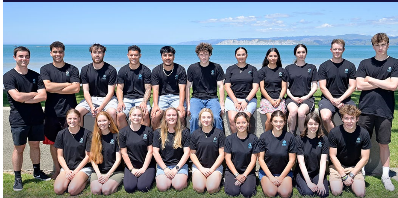
The Mātai summer internship cohort of 2023-2024