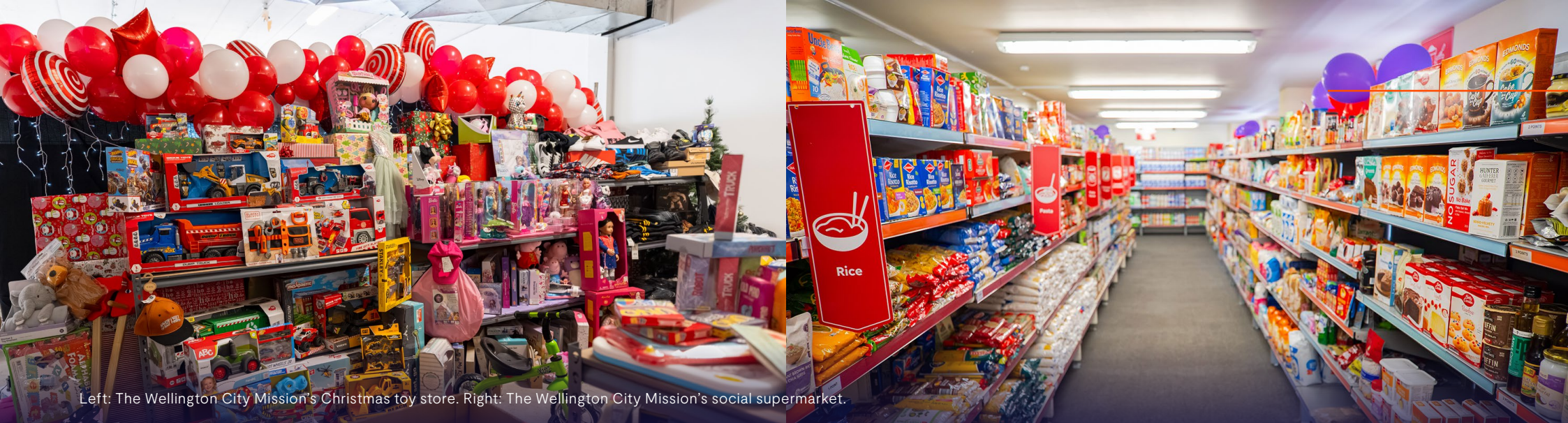
Left: The Wellington City Mission's Christmas toy store. Right: The Wellington City Mission's social supermarket.